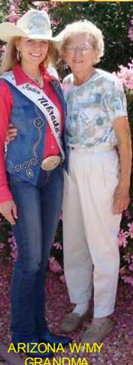
ARIZONA W/MY GRANDMA