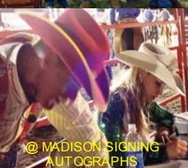
@ MADISON SIGNING AUTOGRAPHS