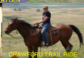
CRAWFORD TRAIL RIDE