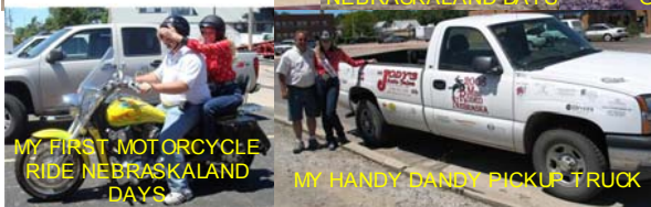
MY FIRST MOTORCYCLE RIDE NEBRASKA LAND DAYS