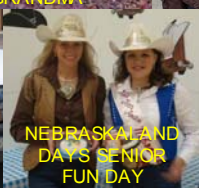
NEBRASKA LAND DAYS SENIOR FUN DAY