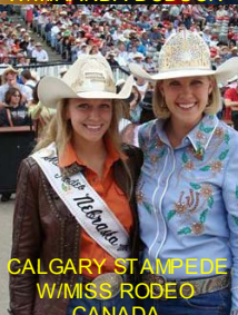
CALGARY STAMPEDE W/MISS RODEO CANADA