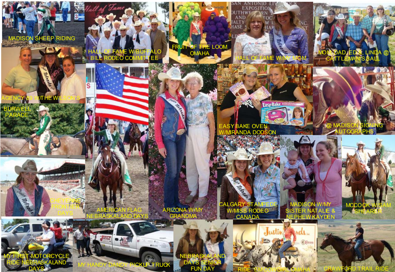
MADISON SHEEP RIDING