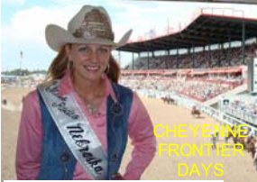
CHEYENNE FRONTIER DAYS