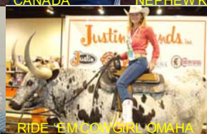
RIDE 'EM TOWN GIRL OMAHA